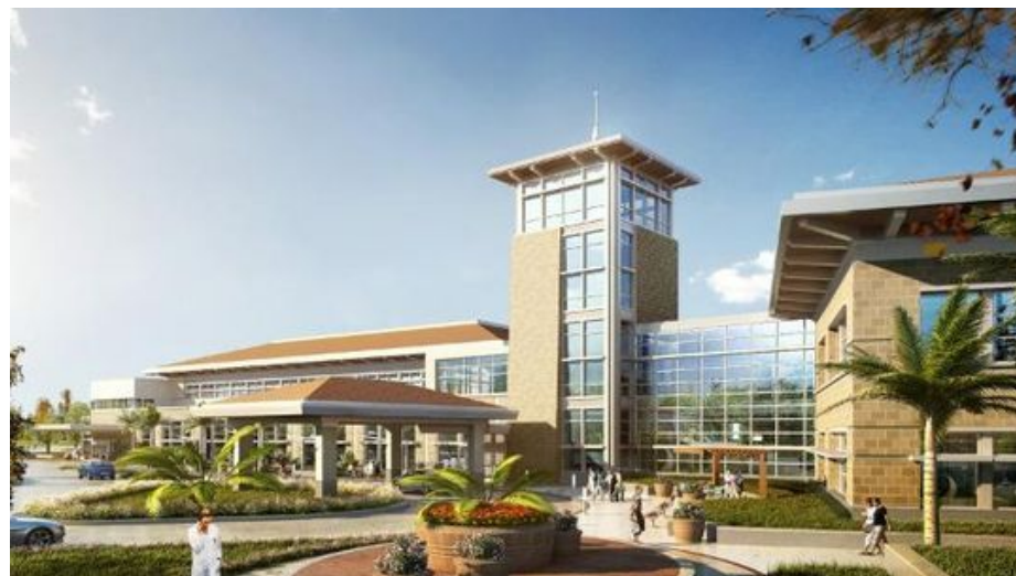
Future Services at Lee Health Coconut Point

The southern section of the Village Center also includes American House Coconut Point, a senior living facility which opened in September 2016. It has 194 units of varying types including independent living, assisted living and memory care. American House is within walking distance of Lee Health Coconut Point.