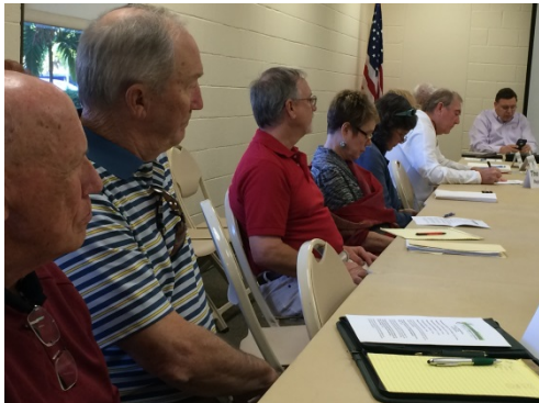
ECCL representatives and alternates at the Estero Community Park on Feb. 12

The ECCL is partnering with Healthways, the managers of the Blue Zones project. One facet of the Blue Zones project is to encourage restaurants and clubs to prepare, serve and promote healthful food choices. The ECCL is also working with the chef-educator at Estero High School on this project. ECCL also continues to support LMHS's Healthy Lee project.